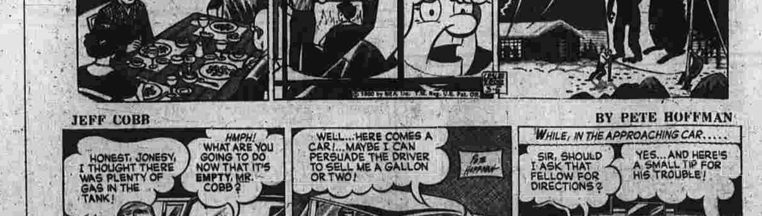
THE APPROACHING CAR